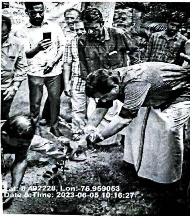
Planting sapling at PWD Guest house by Hon'ble Minister for Public Works

As a part of this NSS SCTCE cleaned and planted trees in PWD guest houses of 14 districts of Kerala at the same time. People interacted in the event through online sessions. Event was conducted in the presence of Honourable Minister for Public Works Department and Tourism, Government of Kerala.