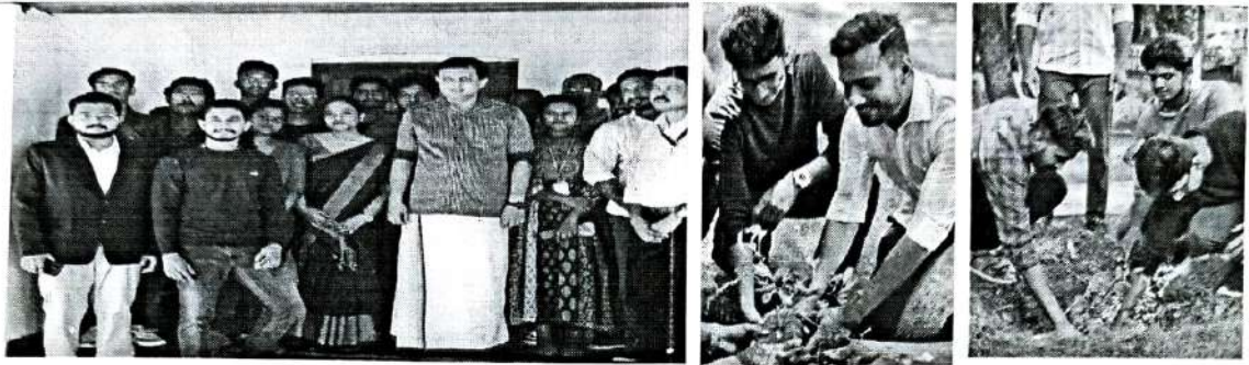
Regional Level tree planting session at PWD Guest House, Thycaud.

Through active participation in tree planting and engaging in discussions about environmental responsibility, students gain valuable insights into the importance of preserving and protecting the natural world. The hands-on experience of planting saplings contributes to their understanding of ecosystem dynamics and the role individuals play in environmental conservation.