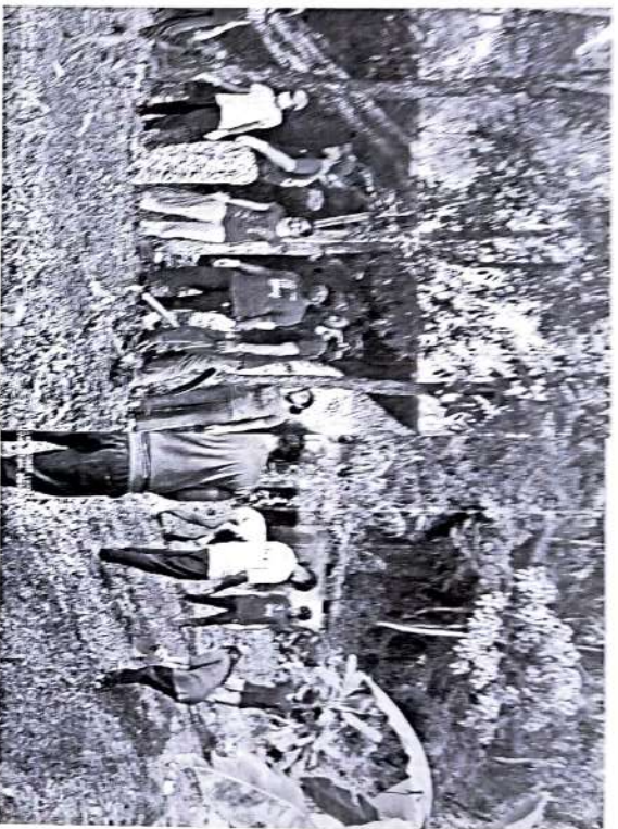
Volunteers involved in cleaning primary health centre premises